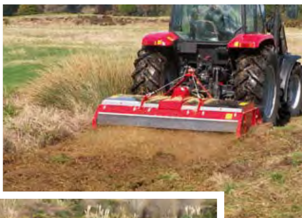
Coarse foliage is easily handled due to high blade tip speed