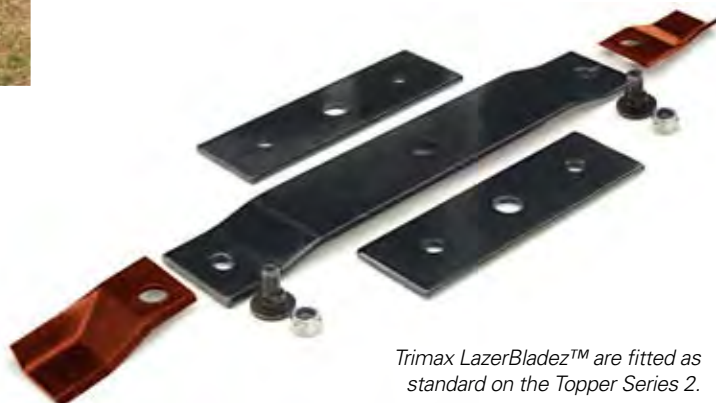
Trimax LazerBladez™ are fitted as standard on the Topper Series 2.

The super heavy duty spindles have a two year warranty and are fitted with Trimax's exclusive LazerBladez™ fling tip blades. The tilt-forward design of LazerBladez™ virtually eliminates hang back ensuring the cleanest and most efficient cut possible, even in the toughest conditions. Built to last, the Trimax TopperS2 is your ideal pasture topping partner.