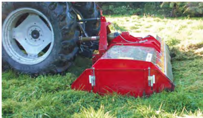
The floating headstock is ideal for uneven terrain

Trimax has improved overall performance by upgrading to an all new drive system that is designed specifically for use with today's higher powered tractors. Twin belts transfer power from the gearbox directly to each spindle, providing maximum torque even in the heaviest conditions. Tensioning the belts is incredibly easy and is now done from the rear of the mower without the need to remove any covers.