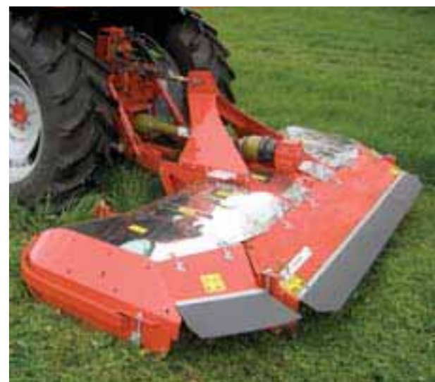
Handles infrequently mown long grass with ease.