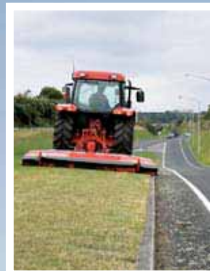
Rollers allow mowing along edges.

With downwing flotation, simple and infinitely variable height adjustment, full width striping, innovative new maintenance features and LazerBladez™, the StealthS2 will continue to set the standard for many years to come.