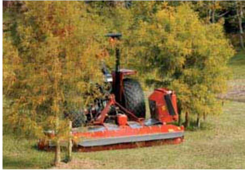
The StealthS2 can be operated with one or both wings raised, giving the added versatility of three cutting widths in one mower.

Full width rollers provide a brilliant full stripe effect for sports turf and golf courses alike.