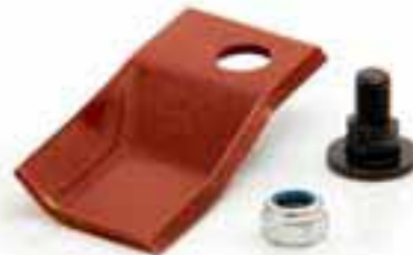
Trimax LazerBladez™ fling-tip blade, blade bolt and self locking nut.