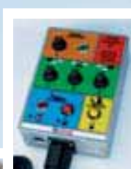
Hydraulic deck controller and kerb jump.

For superb results in everything from municipal mowing to golf courses you simply can't go past the Trimax PegasusS2 Elite.