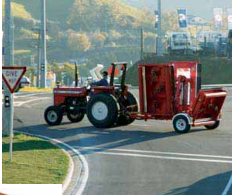
Moving between locations is a safe and easy exercise. Decks are hydraulically lifted and automatically locked into place for transport mode.

Superb deck articulation and Trimax LazerBladez™ are just two of the many features of the Pegasus Series 2.